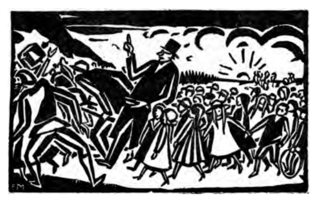
A LITTLE GIRL with a little impertinent snub nose.